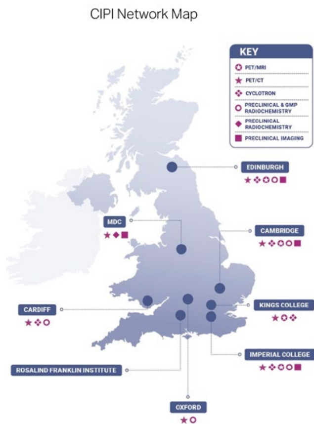
The UK PET Innovation Network brings together researchers and facilities from across the country.

This report summarises key points from all these discussions, and offers a first glimpse of how a nationally accessible PET Innovation Centre could